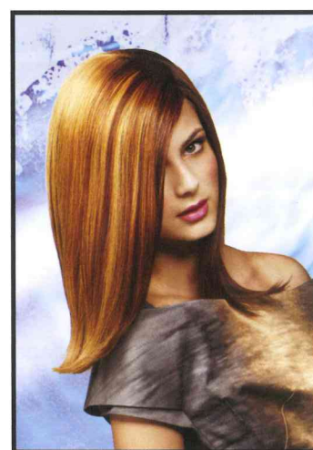
ALFAPARF LARGE FABRIC IMAGES TO HANG IN SALON